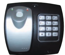
Horizontal mounting with keypad