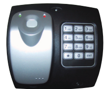
Horizontal mounting with keypad